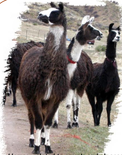
Llamas, related to camels and alpacas, have an under-fleece that is extremely soft and strong

We have access to silk and cotton, and the newer fibers made from soy byproducts, corn, and bamboo.